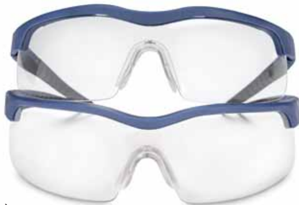
Shown: Medium (top) Large (bottom)

All Uvex® lenses offer 99.9% ultra-violet protection.